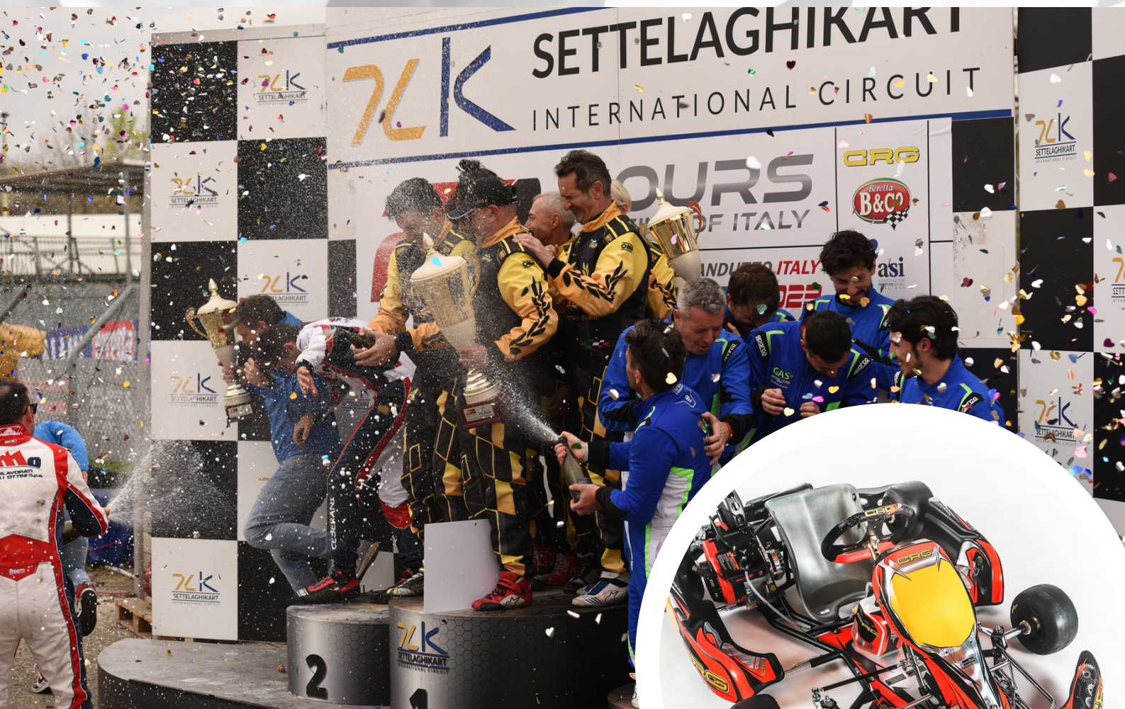
Go-kart CRG FS4 della categoria Briggs Kart Championship Premio finale per il 1° classificato categoria PRO Valore Euro 3.870,00 (Iva Inclusa)

A Trophy is also set up for the COMPETITORS which will collect the team manager of the team that has scored the highest number of points in the Final on the podium with its own drivers (see complete rules on the Sporting Regulations which will follow shortly).