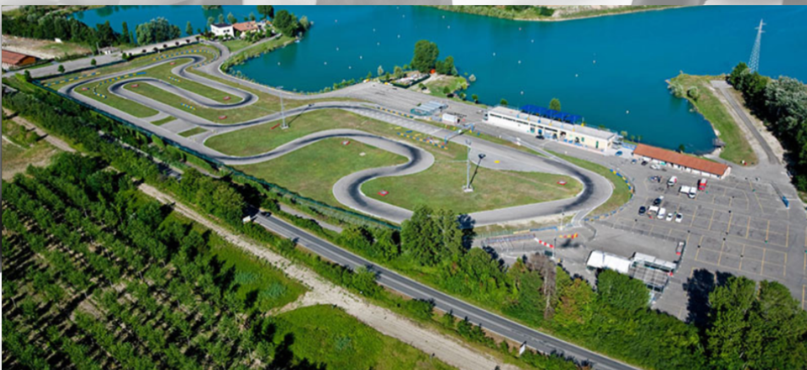
Il circuito 7 Laghi Kart di Castelletto di Branduzzo (PV) visto dall'alto

All drivers will have a hospitality area and an area equipped with lockers and changing rooms at their disposal.